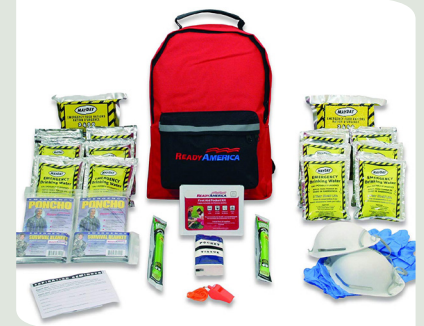
READY AMERICA EMERGENCY KITS

Freedom flashlight • pry bar the wrecker 30" • zipper storage bags • hand warmers • toilet seat • alternate cooking source such as BBQ, and an axe.