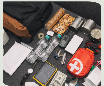
ADDITIONAL SUPPLIES FOR KITS